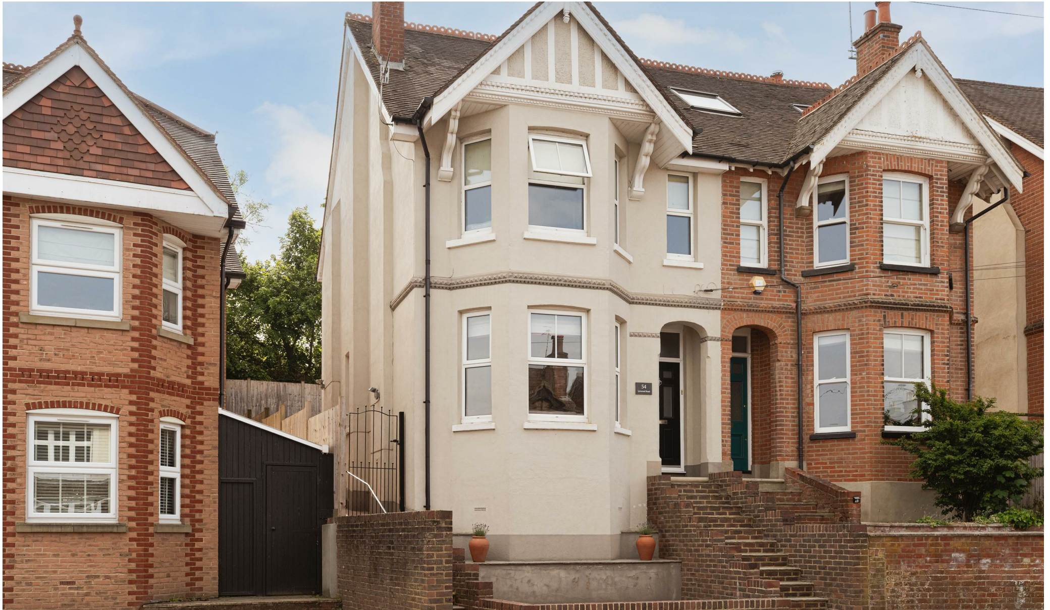
Lynwood Road, Redhill £750,000